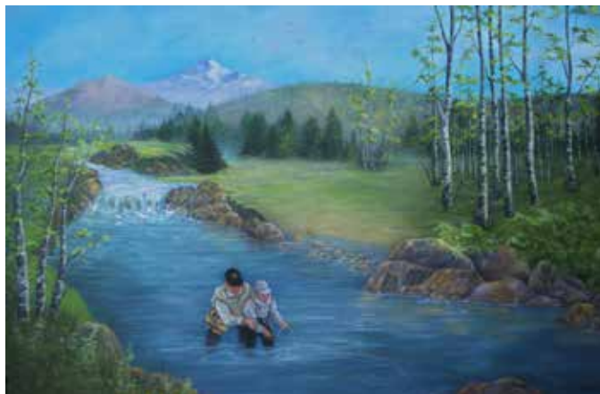
Created by VITAL participant Valeen T., Ocean Shores, WA